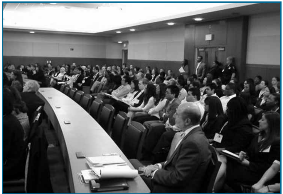
FAMU students and members of the ABA Law Student Division filled the courtroom for live oral arguments in front of the Fifth District Court of Appeals for Florida.

Generally, we find that our students gain a level of insight into the appellate process that they could get only if they went to the court. This event brings