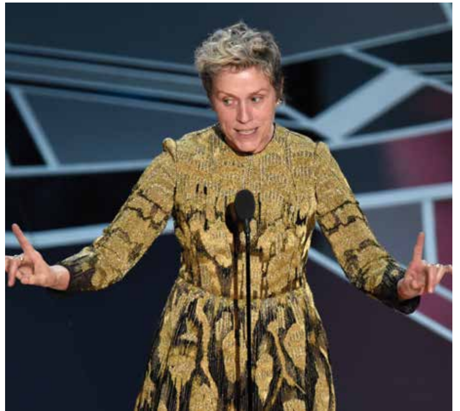
Frances McDormand accepts the award for best performance by an actress in a leading role for “Three Billboards Outside Ebbing, Missouri” at the Oscars on Sunday, March 4, 2018, at the Dolby Theatre in Los Angeles.