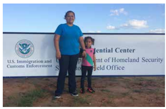
A mother and her 6-year-old daughter outside Dilley Family Detention Center.

By resorting to family detention practices without regard to these foundational principles, indiscriminately labeling families as threats, and refusing to determine and utilize the least restrictive means of achieving compliance with immigration proceedings, DHS has not met its emergency preparedness, legal or fairness goals. These failures have left in their wake a population of traumatized children and their parents, struggling with the consequences of unnecessary detention. As a result, adjudication of asylum claims has become haphazard and unfair, and legal services have been redirected and depleted. Looking towards the future, DHS must be prepared for the inevitable, periodic influxes of migrant families seeking status. This requires the advanced development, and fair implementation, of viable plans to accommodate these marked changes by means other than detention, or release to the community with excessive supervision requirements, and accelerated deportation proceedings lacking in due process.