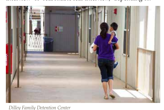
Dilley Family Detention Center

As a result of this policy, instead of being released, families apprehended at the border and sent to one of the family detention centers were generally put into expedited proceedings.<sup>87</sup> These proceedings can result in quick deportation.<sup>88</sup> Individuals placed in expedited proceedings, however, still must be allowed to bring an asylum claim before an Immigration Judge if they pass a government screening interview, demonstrating that they have a viable chance of success on the merits of their claim, thereby giving them the right to remain in the United States.<sup>89</sup> Those individuals placed into removal proceedings are detained at least until they pass the screening interview, called a "credible fear interview" or "reasonable fear interview," depending on