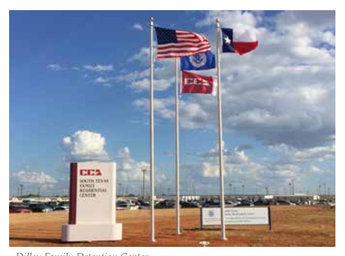
Dilley Family Detention Center

Many additional law firms around the country are providing further pro bono assistance. Through APBCo, several firms toured the various detention facilities and are representing individual families as those detainees are released and dispersed to cities in every region of the nation. Other firms are involved in White House meetings. Still more are helping to staff the accelerated family dockets in other parts of the country. Several have sent attorneys to Dilley and Karnes to work for limited periods of time. Others are working with their local immigration legal services providers to represent former detainees in post-release proceedings around the country. Firms such as Chadbourne & Park are coordinating overcrowded immigration dockets, working to represent, or find representation for, the hundreds of immigrants in their home courtrooms in desperate need of assistance. In California, several firms are coordinating clinics to assist families with the timely filing of initial pleadings and applications for relief.