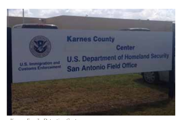
Karnes Family Detention Center

as release allows for more time to prepare the claim and better and more frequent access to lawyers, witnesses, experts, and translators who can help prepare and document the case. 169 It also offers the possibility for the traumatized family to heal sufficiently in order to recall and recount their experiences in a manner that will best support an asylum claim through written and oral testimony. Families cannot engage in this process adequately in a restrictive detention setting. Indeed, one study found that even for represented detainees, the success rate of obtaining relief was 18%, compared with a 74% success rate for those immigrants who are represented but not detained. Accordingly, policies that result in the continued detention of asylum-seeking families significantly threaten their ability to prepare their cases and thus place at significant risk their due process right to have the case fairly and adequately heard.