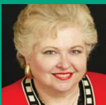
Special Award Sarah Weddington Adjunct Professor, University of Texas at Austin, Austin, TX