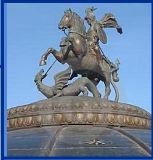
The Ritz-Carlton, Moscow