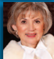
Special Award The Right Honourable Madame Chief Justice Beverley McLachlin Supreme Court of Canada; in Ottawa, Ontario