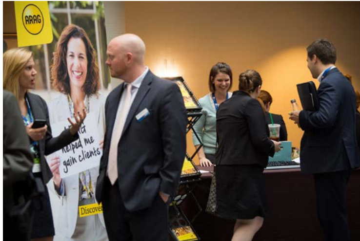
EXHIBIT TABLES — $1,900 USD ($1,500 for non-profit and academic institutions) Companies are welcome to acquire an exhibit table if they are not allocated to Platinum and Gold sponsors. Each table top exhibit include 2 six-foot draped tables and two chairs. This Sponsorship includes one “exhibit area only” badge for each exhibit table.