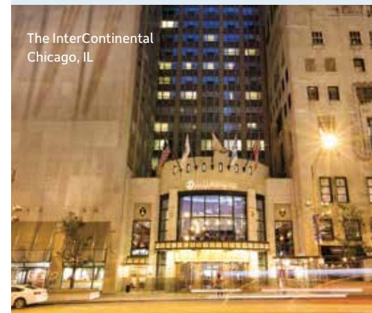
The InterContinental Chicago, IL