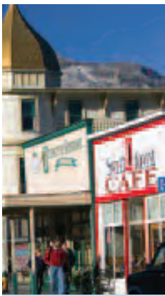
itory, still echoes with the