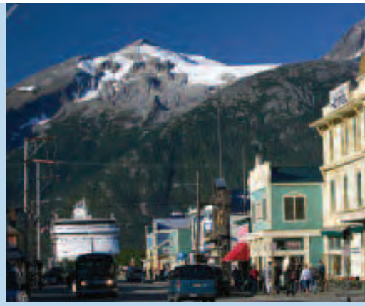
Skagway's historic downtown, gateway to the Yukon Territory, captures the excitement of Alaska's Gold Rush days.