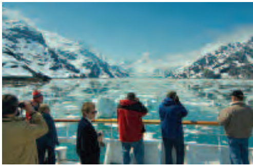
Admire Alaska's magnificent mountainous landscape, a backdrop to stunning glacial silt-colored waters.