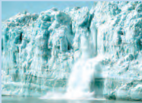
Ice calving from Hubbard Glacier.

A renowned, beautiful Inside Passage city-borough (self-governing community) built on Baranof Island, Sitka is laden with the art and history of its Russian, American and native Alaskan past. It was originally settled by the native Tlingit people, but by the late 1790s, Russian fur traders had become permanent settlers. During optional excursions, you can choose to explore the native artifacts in the National Historical Park and an impressive collection of gold and silver icons in St. Michael's Russian Orthodox Cathedral, or visit the Raptor Rehabilitation Center, Alaska's foremost bald eagle habitat, where more than 100 injured eagles recuperate and are released back into the wild each year.