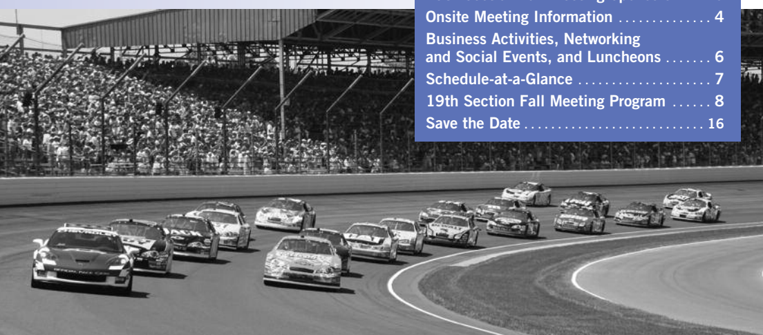
Indianapolis photos courtesy of Indianapolis Convention & Visitors Association